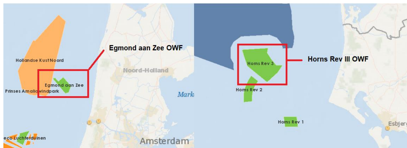
Figure 1. Location of the Egmond aan Zee (on the left) and Horns Rev 3 (on the right) offshore wind farms.

Egmond aan Zee is located 10 - 18 km off the Dutch North Sea Coast and comprises 36 wind turbines with scour protected monopile foundations (Figure 1, on the right). The selected hindcast data corresponds to the coordinates latitude of 52.606°N and longitude of 4.419°E. The hindcast data for this case study was obtained from CMEMS hindcast data and has a temporal resolution of 3 hours. The available time-series covered the period between 01-01-1980 to 31-08-2021, which resulted in 117120 pairs of significant height and joint peak periods. The water depth was assumed as 20 m and the remaining details for this case study are provided in Figueiredo et al. (2022).